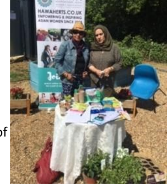
Page 16 of